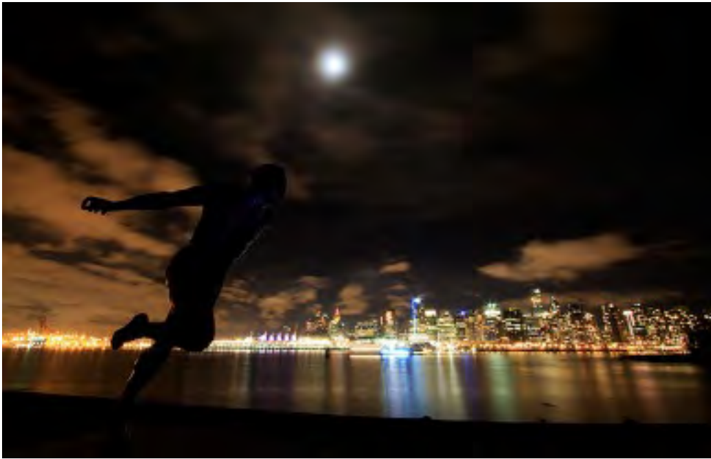
The Twilight Runner by Robin Ryan

Again, see how the water brings more light into our images, sections out negative space and can create gorgeous symmetry. Another delight of night work is the way lights will fracture into stars on their own – no special effects here, just time. 25 seconds at f/22.