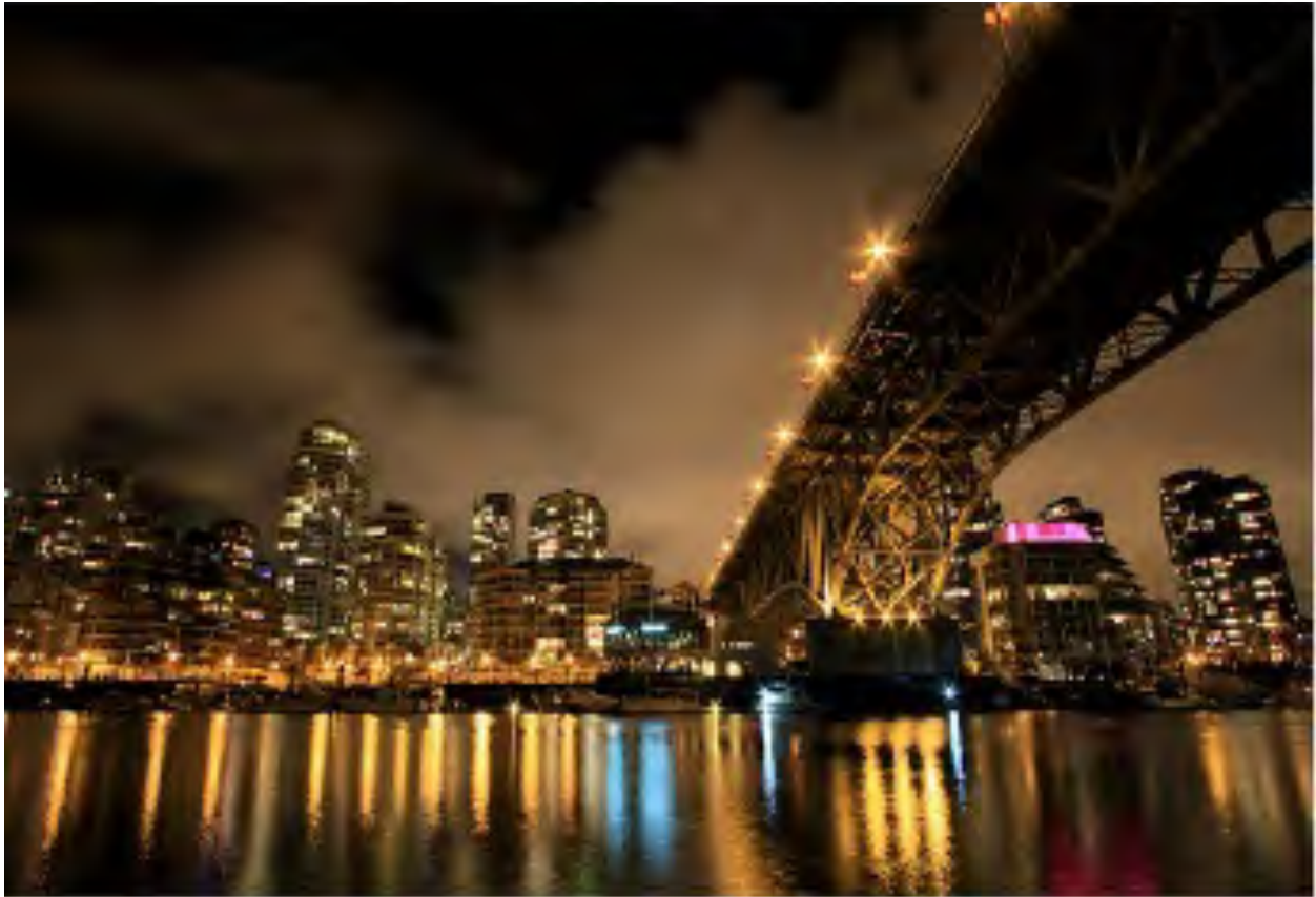
Vancouver in the Night by Robin Ryan

Water is your friend in night work. It seeps up colour, softens it and adds a charming glow to your images. 10 seconds at f/11.