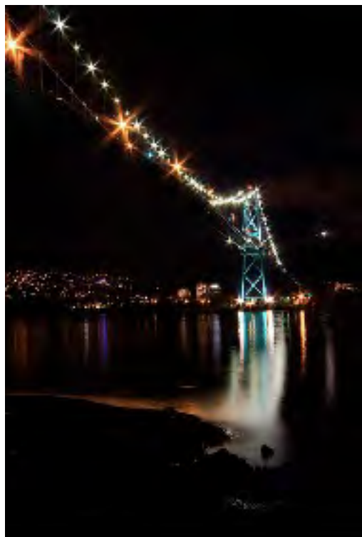
Lion's Gate Bridge by Robin Ryan

Water is your friend in night work. It seeps up colour, softens it and adds a charming glow to your images. 10 seconds at f/11.