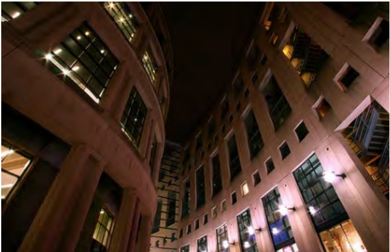
Old World New World by Robin Ryan

The same composition rules that apply to day apply to night, except with night we have our long exposures to take advantage of. I've chosen a selection of my night work to illustrate some tricks of the trade: