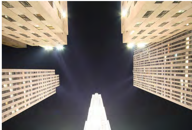
The Rock ii by Robin Ryan

Remember when I said that tripods weren't always necessary? They aren't. The world's full of flat surfaces on which to perch or press your camera. Just make sure to use a timer (the jolt of your finger depressing the shutter can move your camera) and, if you are holding the camera against a vertical surface, keep the speed relatively quick (1/8 of a second to 2 seconds). This was 2.5 seconds at f/22.