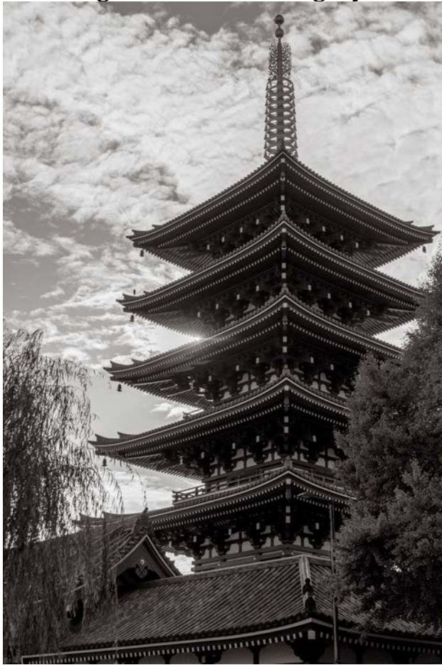
HM Back in the Day - Chuck Stowe, Des Moines