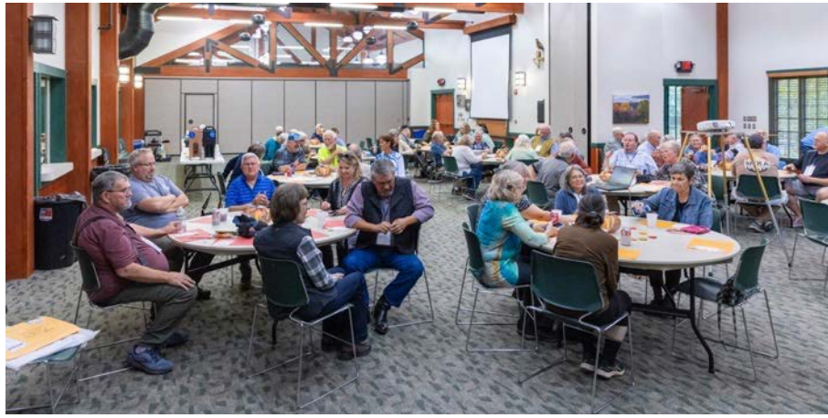
Convention Banquet – 2024 N4C Fall Convention, Ponca State Park