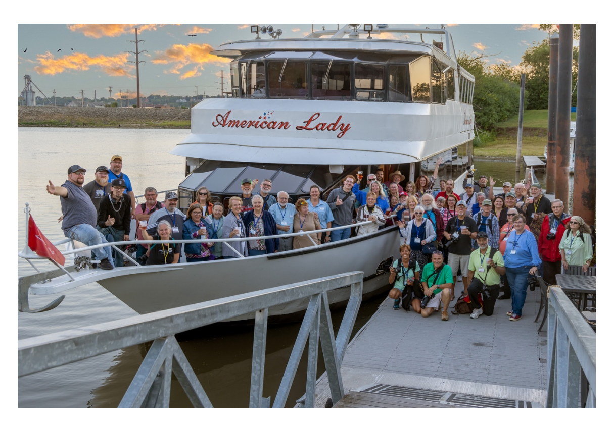
American Lady Field Trip Dubuque Convention