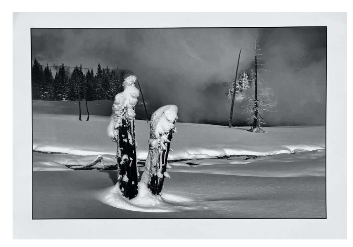
1st Place Best of N4C Digital Black & White