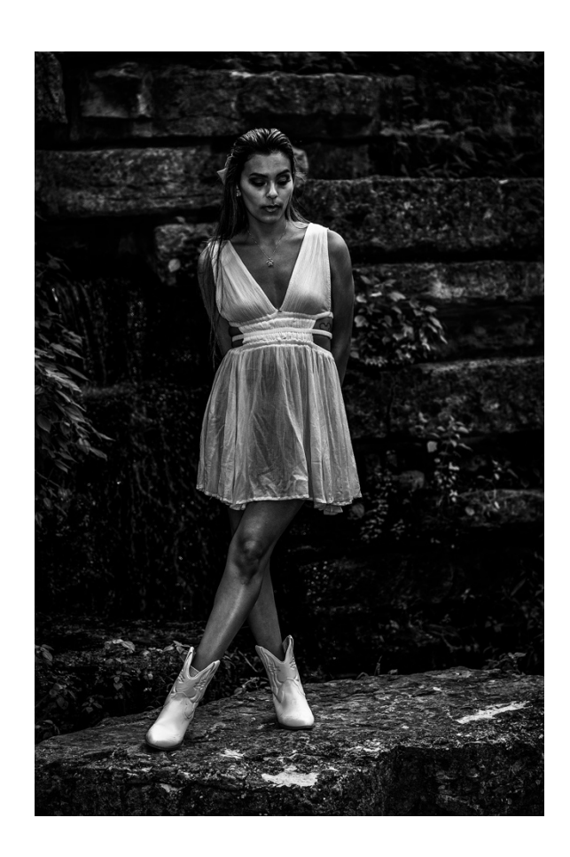
Black & White Model