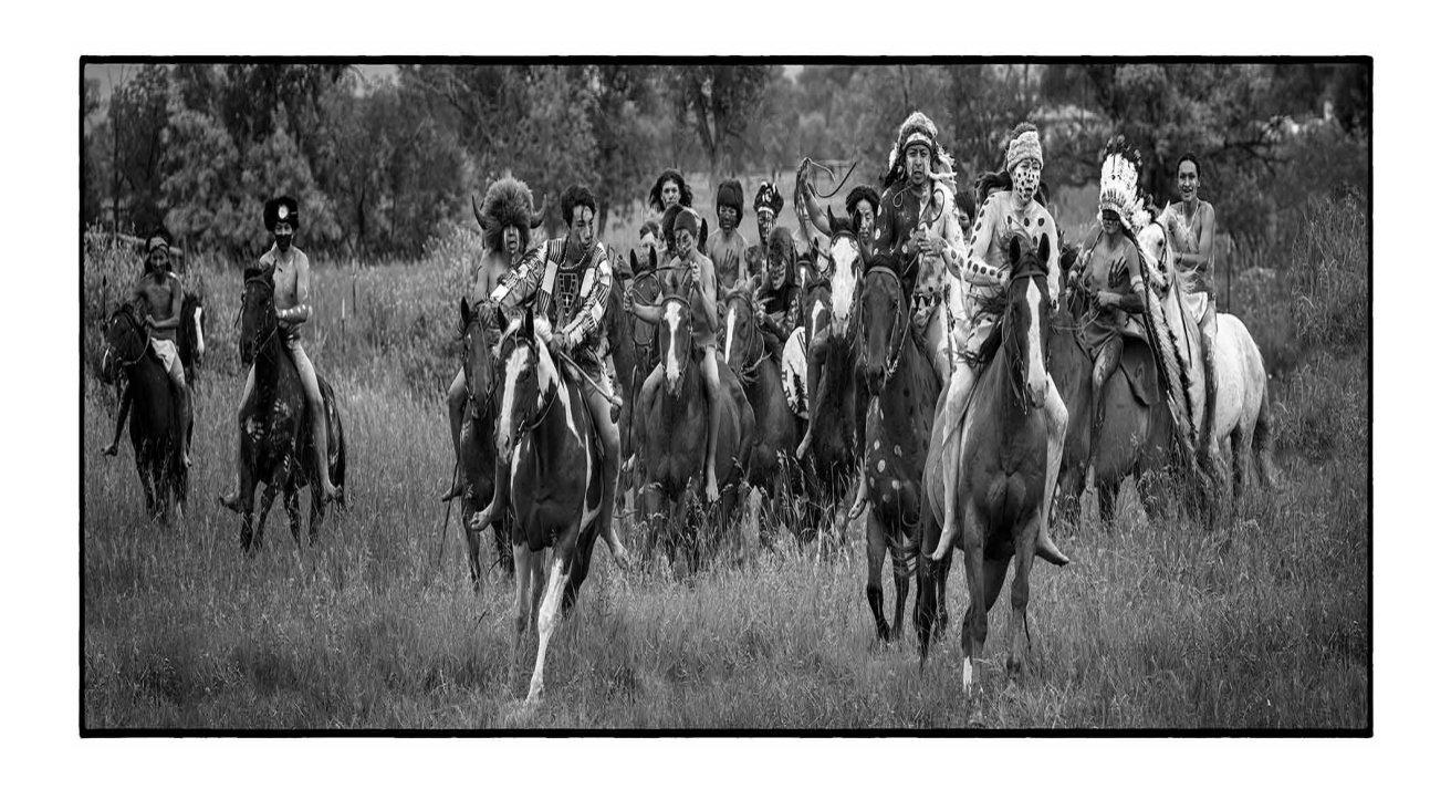
1st Living History.jpeg