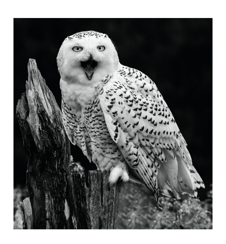
1st Snowy Owl - Sheldon Farwell, Great River