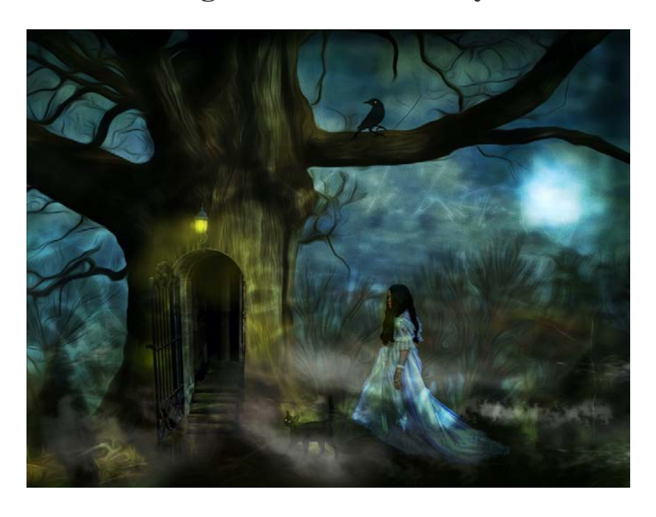
1st Mystery at Midnight - Bob Rude, Iowa City Digital Black & White