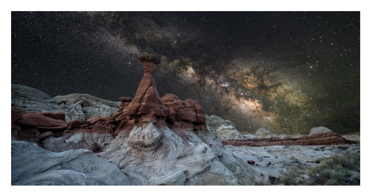
Panaorama 1st Place N4C 2023