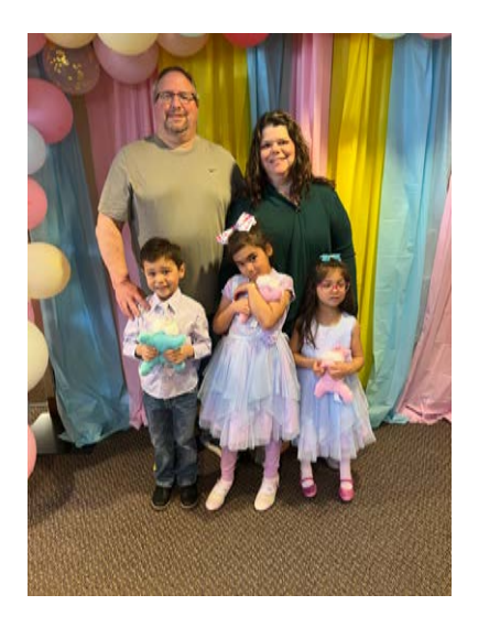
Its October in Camera Land.

Fresh home from another amazing convention put on by the Dubuque camera club. We Rode on Boats, cars and shot trains, rivers and ate from the local food truck vendors. If you missed it, you really missed out. As Competitions ramp up, one thing I have noticed through the years is the art of printing one's photos. Our print display gets a little less each year. I challenge each person in N4C to make a minimum of one print and send in for competition. 8x10 minimum size means you could print at the local drug store for a buck or two, or order online somewhere.