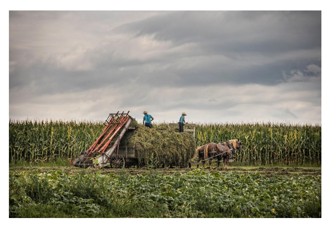
1st Place Best of N4C Digital Pictorial