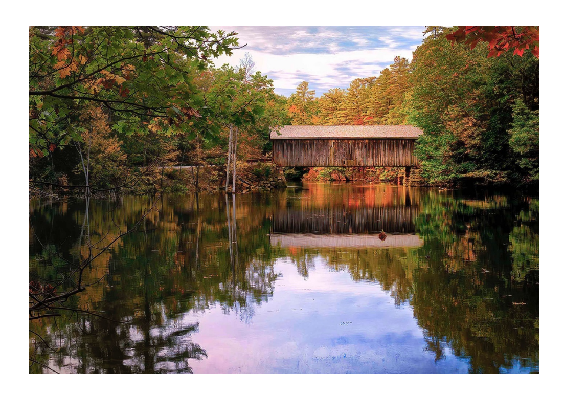
1st Place Best of N4C Digital Travel