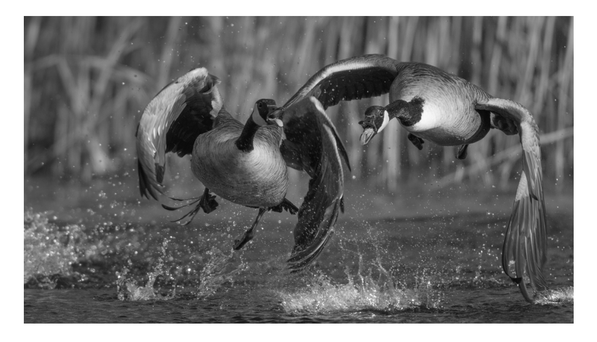
1st Place Best of N4C Digital Black & White