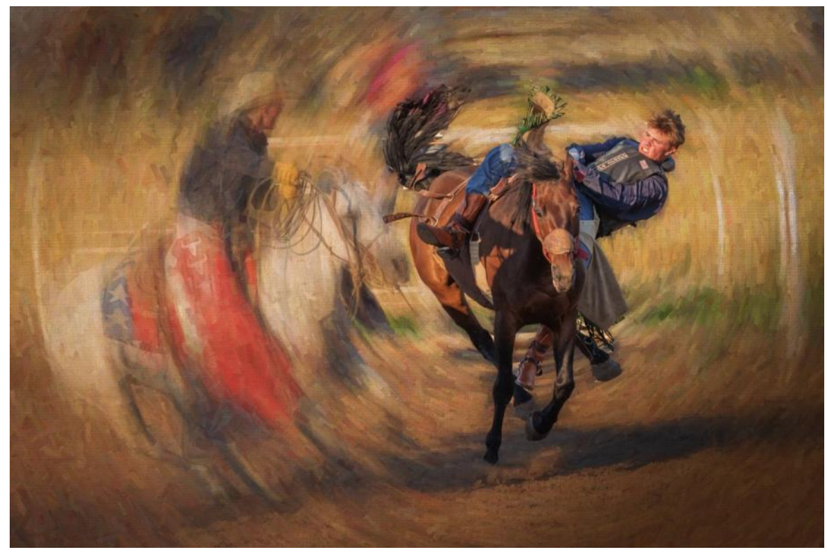
Digital Altered Reality -