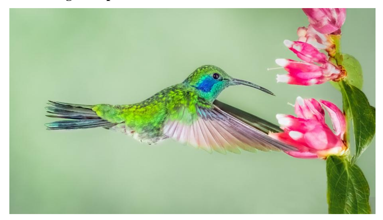
Digital Pictorial Lesser Violetear - Marianne Diericks, Western Wisconsin