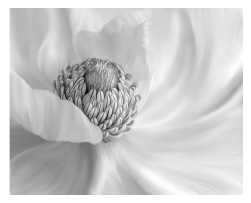
Digital Black & White— Ranunculus Abstract