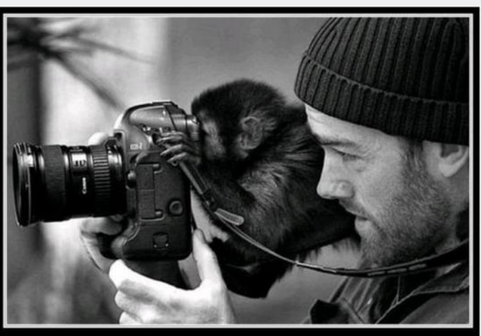
That's the problem these days: Every monkey with an SLR camera Thinks he's a photographer

LIFE IS BETTER WHEN YOU CRY A LITTLE, LAUGH A LOT, AND ARE THANKFUL FOR EVERYTHING YOU'VE GOT. AMEN.