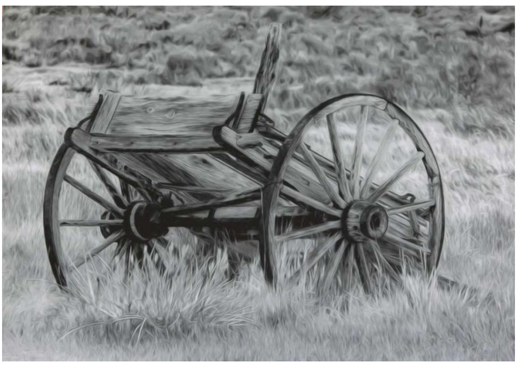
Print Black & White Wilford Yoder Iowa City Camera Club Wooden Wheel Cart