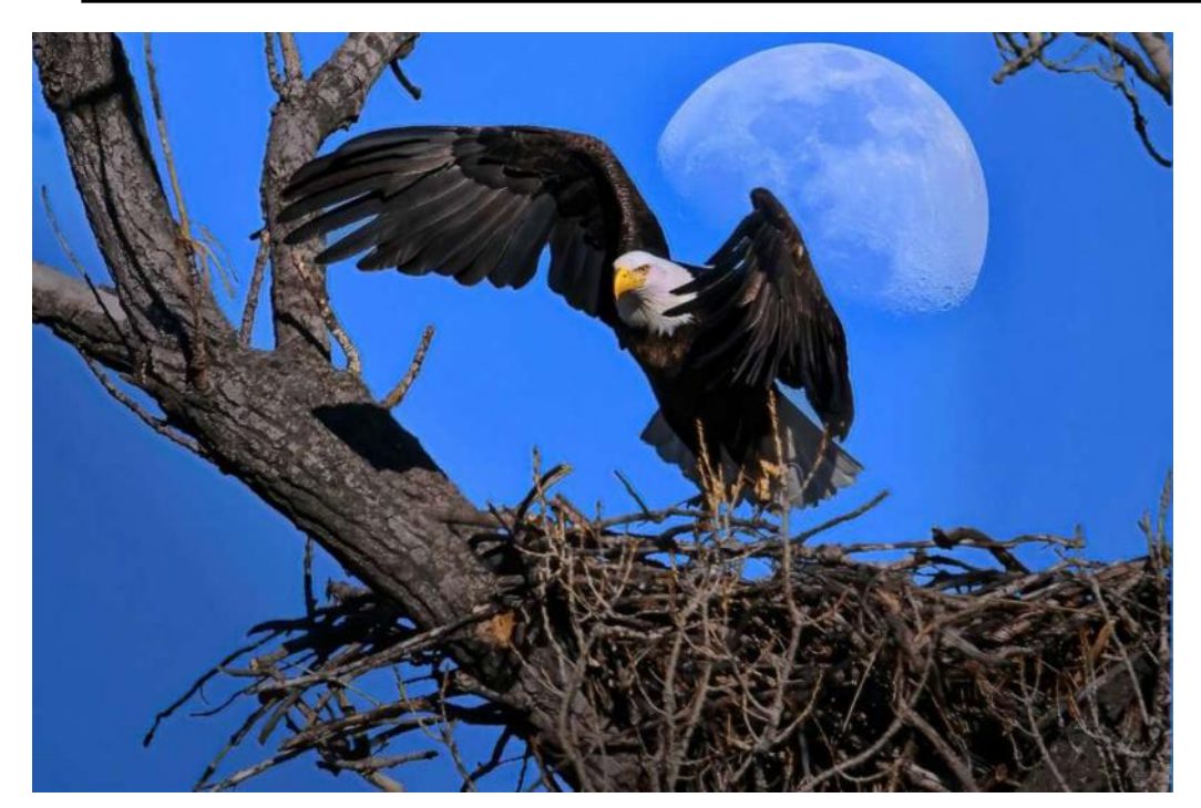
Digital Altered Reality