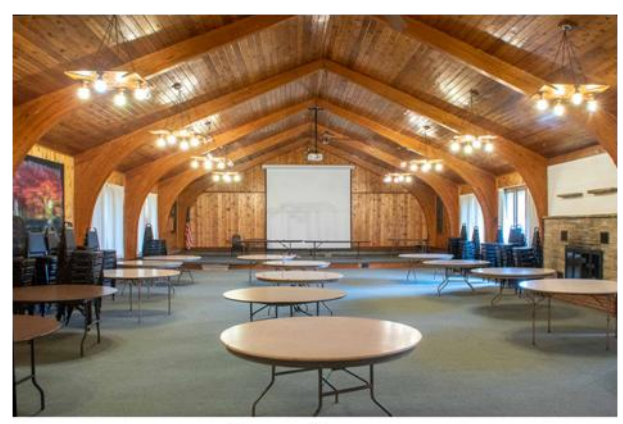
Our meeting space

This year we will be at Wesley Woods Camp & Retreat Center, which is 20 milles south of Des Moines, or 7 miles southwest of Indianola. A map and directions are included below. The facilities are an excellent fit to our needs. The lodging, in particular, looks to be an upgrade from the dormitory style we have had in the past. Most rooms will be two per room (we will not use the upper bunks), so you may want to name a roommate and save Larry Meister the task of pairing you up.