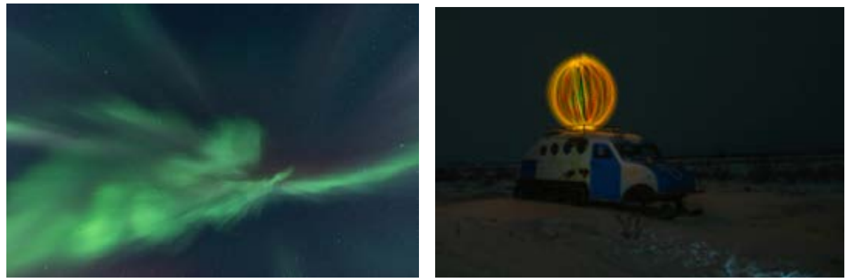
Cloudy nights were for light painting, socializing inside, and fires to gather around outside.

There were four designated spots: an aurora pod with glass top and sides, an aurora dome (also with 360 degree views of the night sky), a remote cabin in the boreal forest (accessed via snowcoach over a frozen creek), and a tepee in the woods. The locations all involved warmth and hospitality inside, and all kinds of options for places to set up tripods outside.