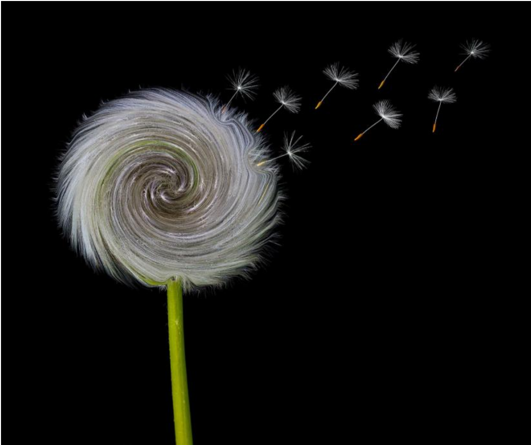
Digital Altered Reality -