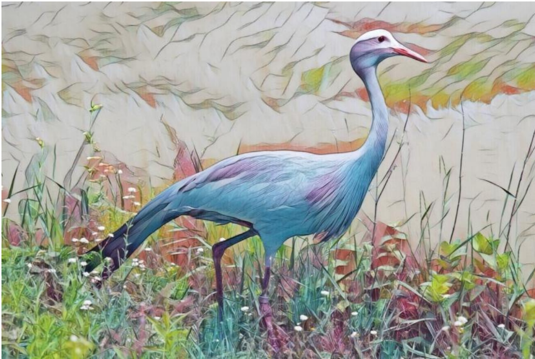
Digital Altered Reality