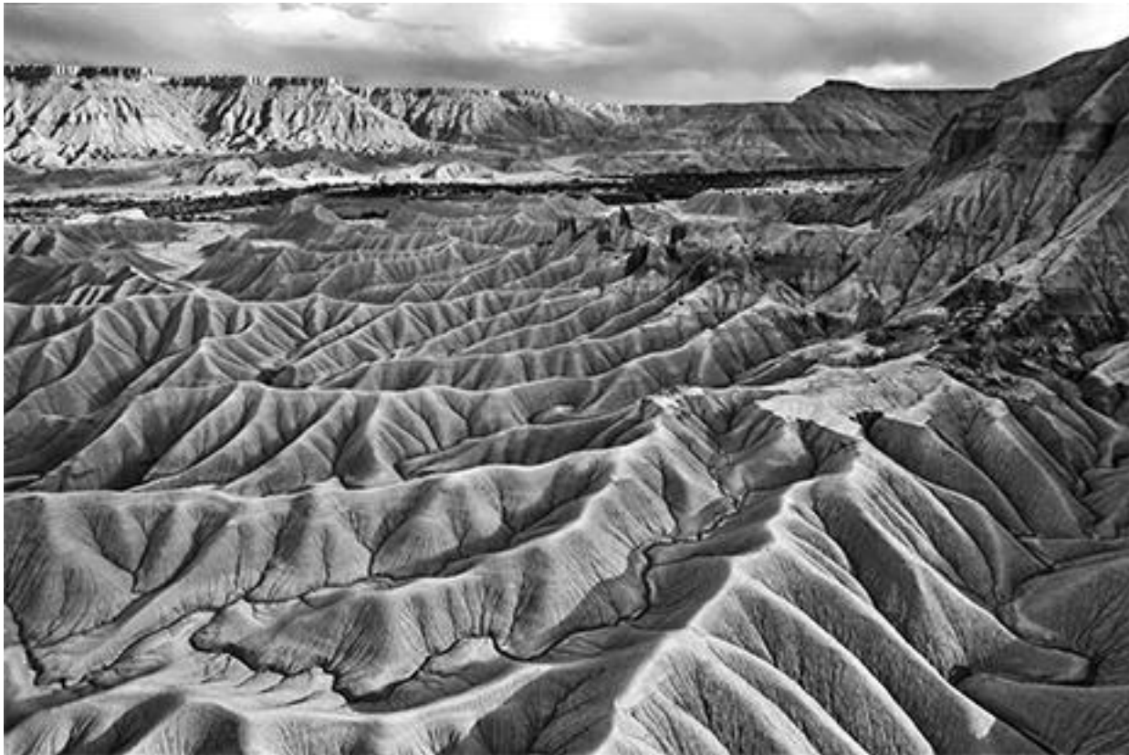
Digital Black & White—North Cainville Mesa—UT—Stephanie Schmitz, Dubuque