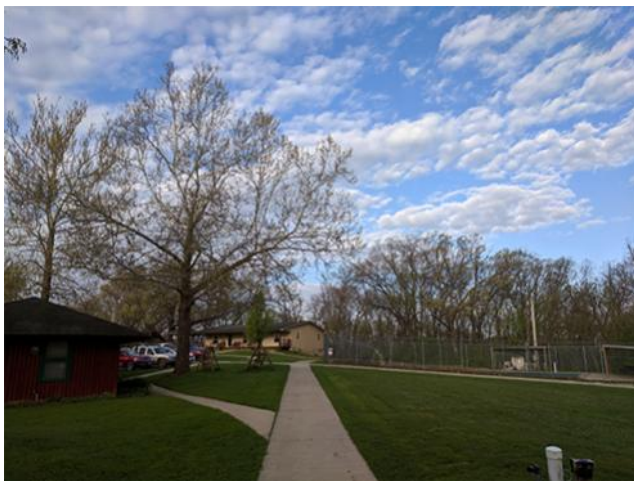
Mini Spring 2018

We will be working from the same contract obligations from 2019.