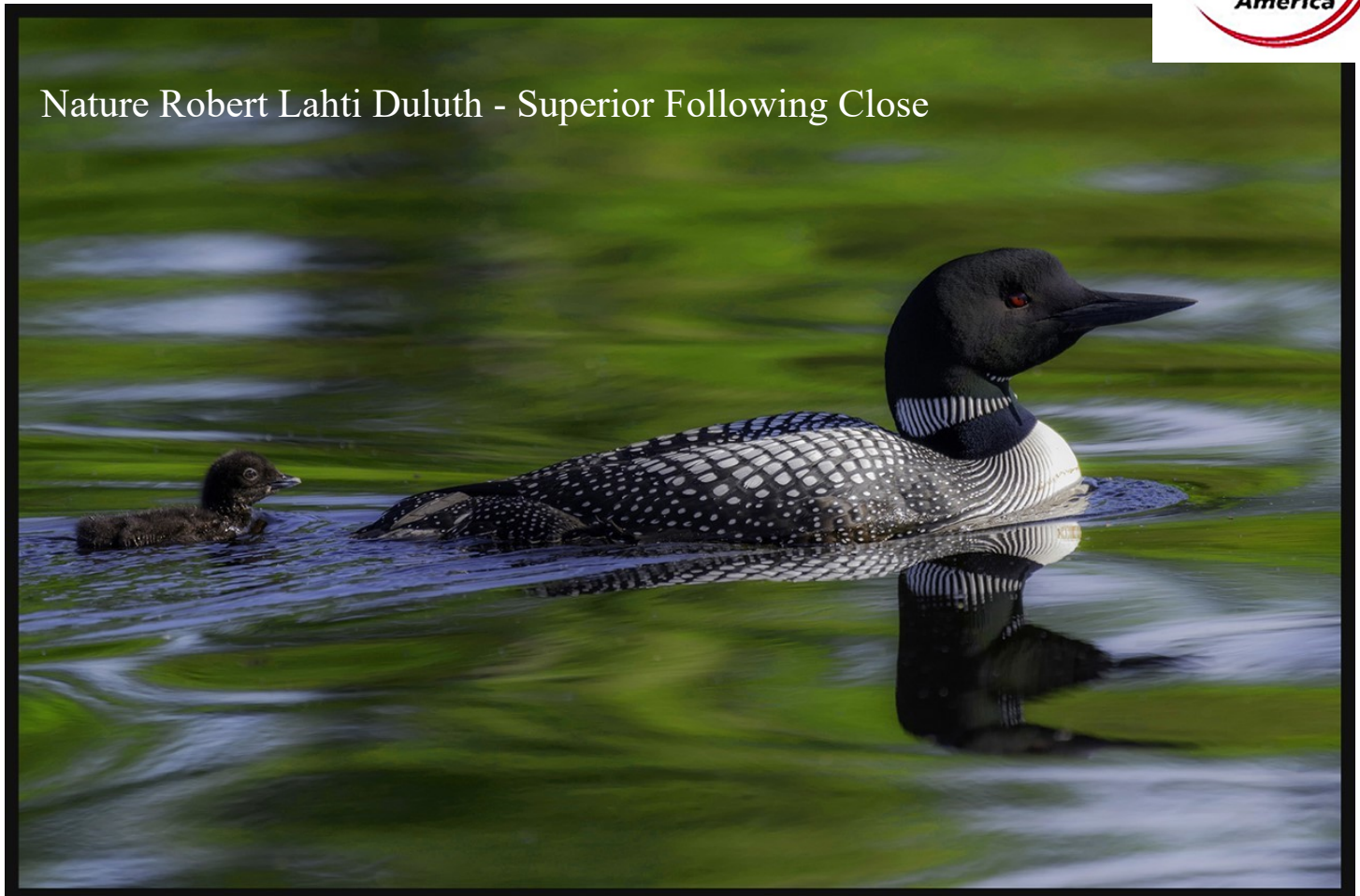
Nature Robert Lahti Duluth - Superior Following Close