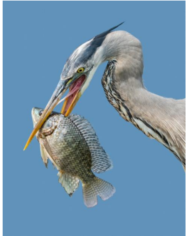
Blue Heron With Fish