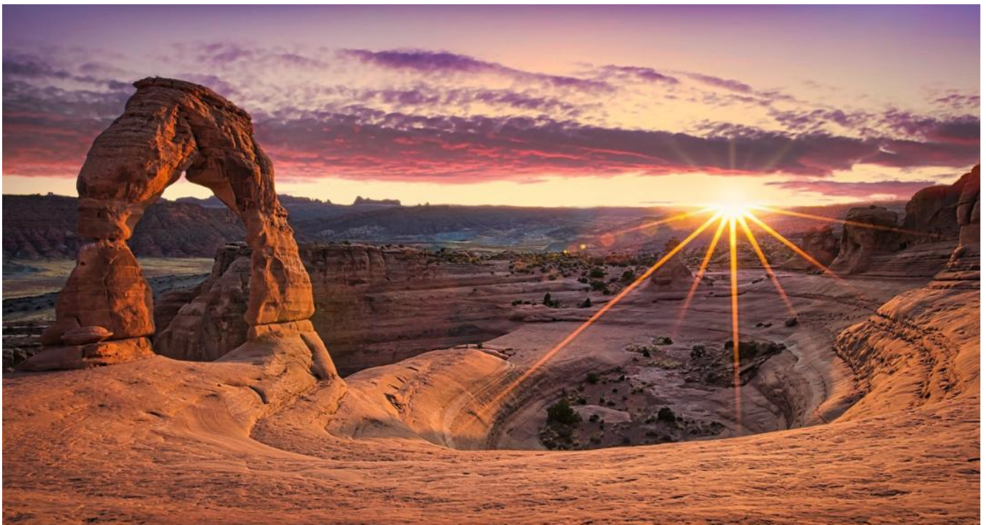
Delicate Arch At Sunset - Utah USA