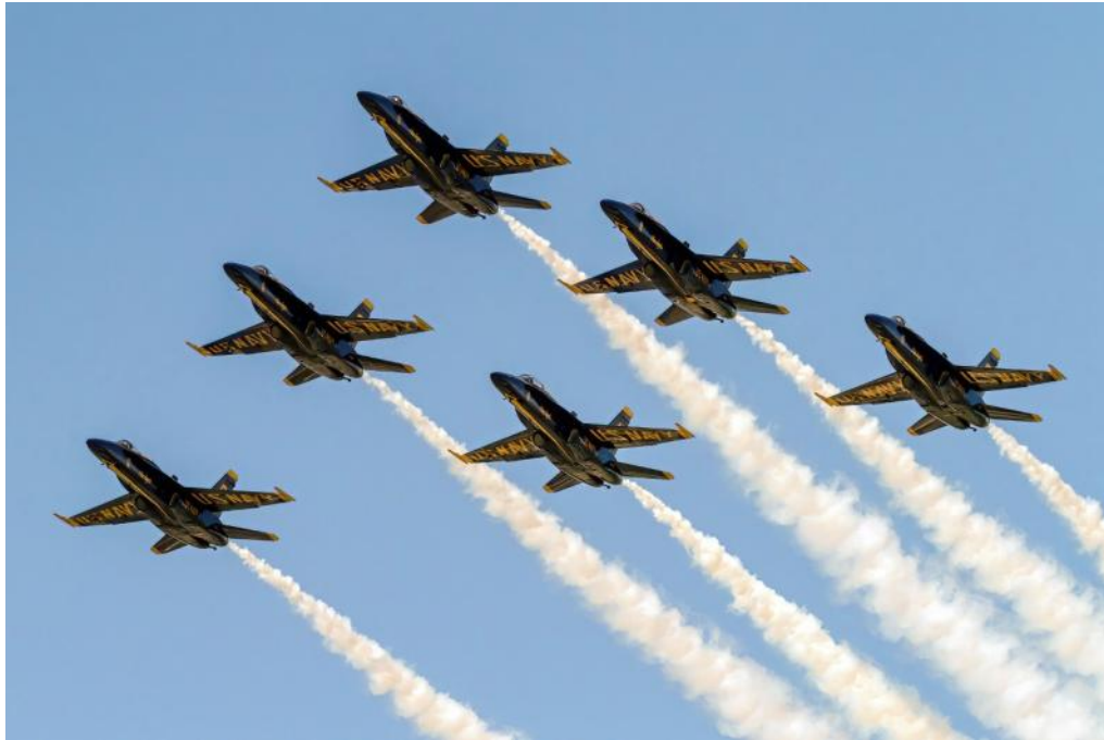
US Navy Blue Angels Flying In Formation Over Fargo ND During Airshow 2015