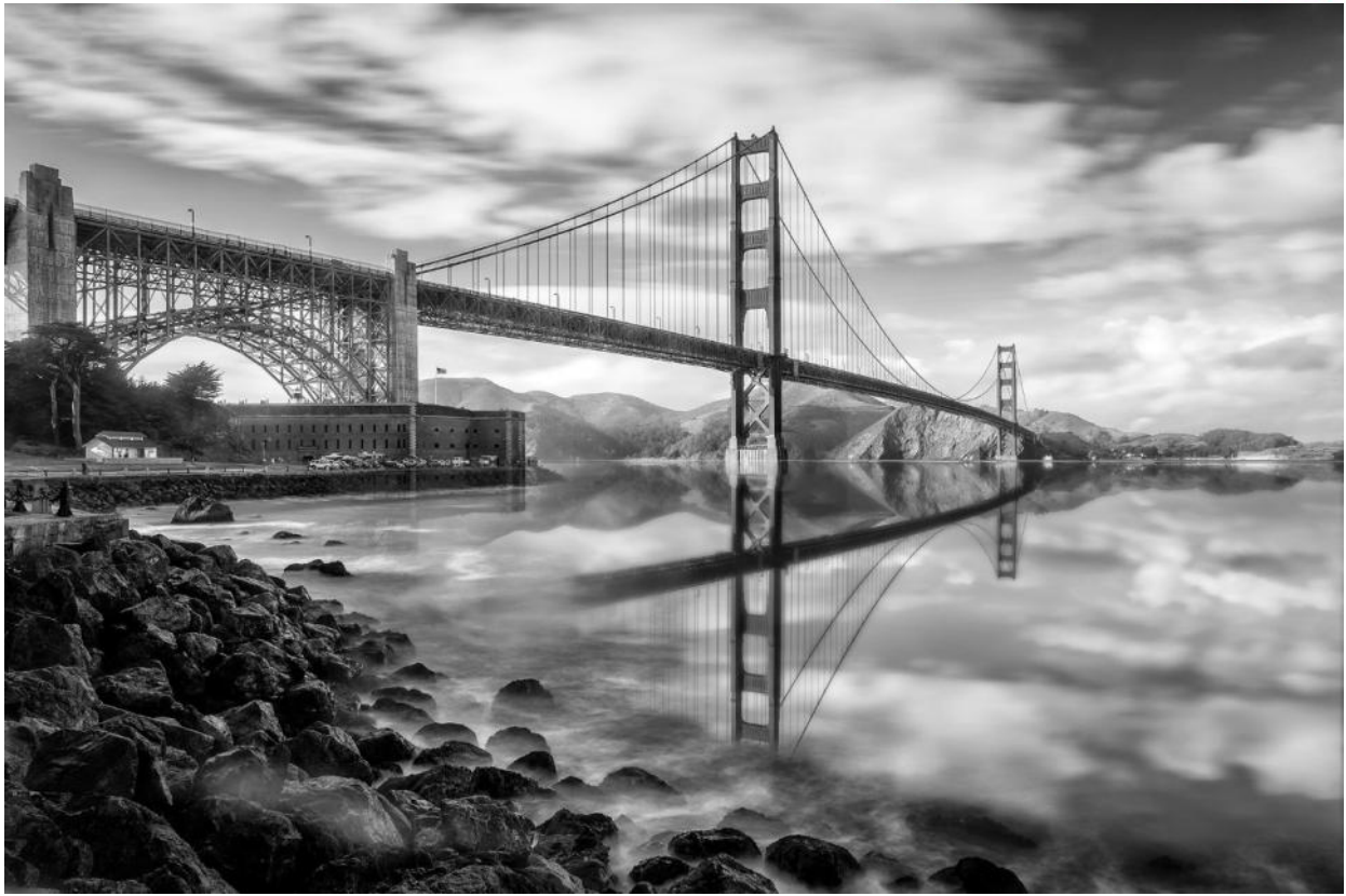
Under The Bridge - Diane Lowry, Des Moines Digital Black & White