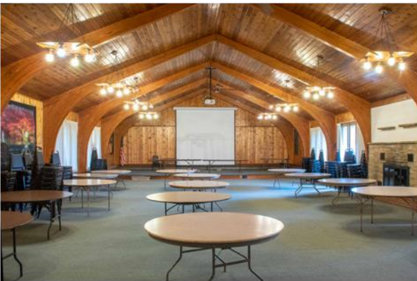
Our meeting space

This year we will be at Wesley Woods Camp & Retreat Center, which is 20 miles south of Des Moines, or 7 miles southwest of Indianola. A map and directions are included below. The facilities are an excellent fit to our needs. The lodging, in particular, looks to be an upgrade from the dormitory style we have had in the past. Most rooms will be two per room (we will not use the upper bunks), so you may want to name a roommate and save Larry Meister the task of pairing you up.