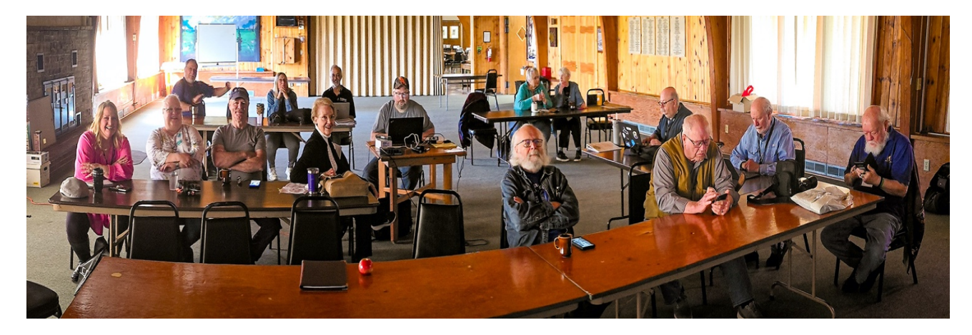
Attendees at the Wesley Woods Mini-Spring Convention in Indianola, Iowa