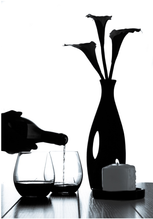
Winnere, Wine for Two, Omaha Camera Club