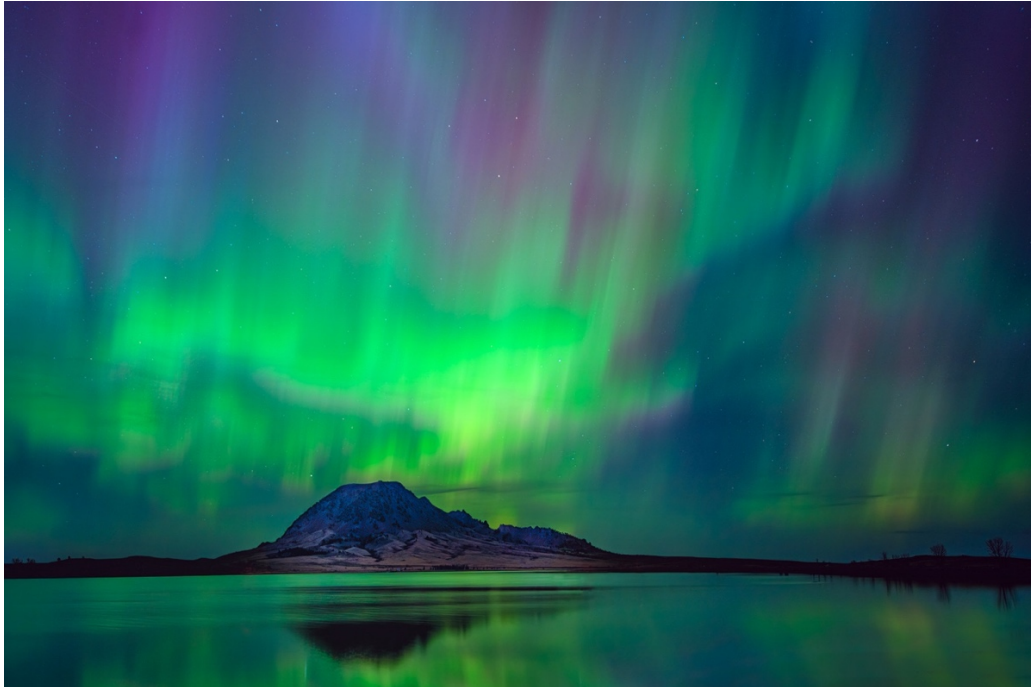
1st Bear Butte Floating in the Northern Lights.jpeg