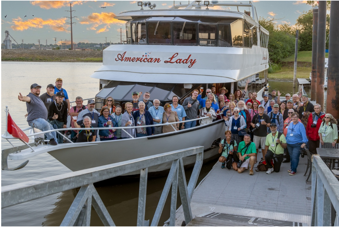
American Lady Field Trip Dubuque Convention