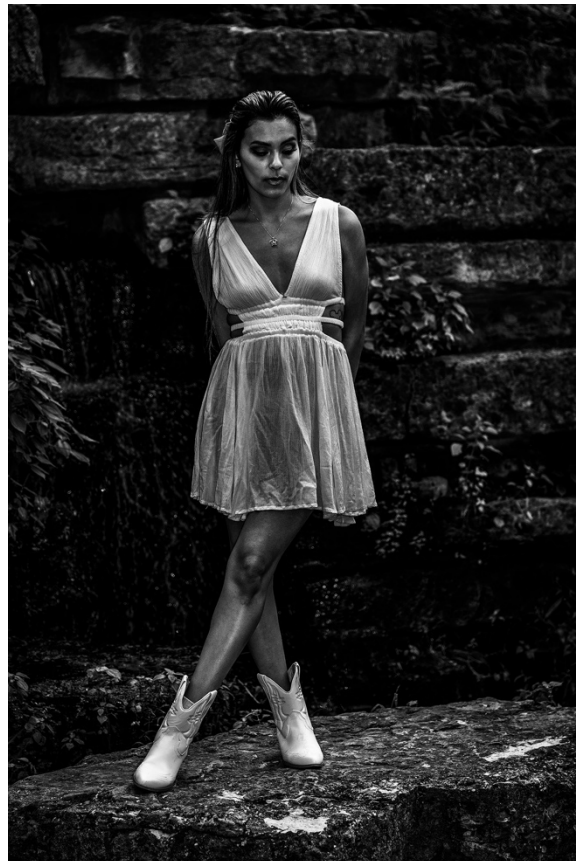
Black & White Model