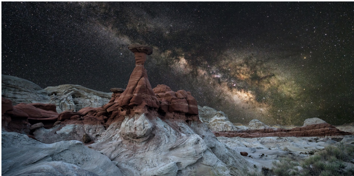
Panaorama 1 st Place N4C 2023