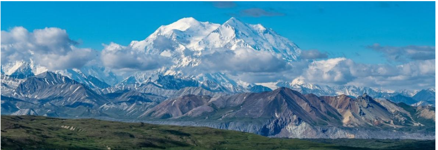
Digital Travel— Panoramic Denali, Alaska