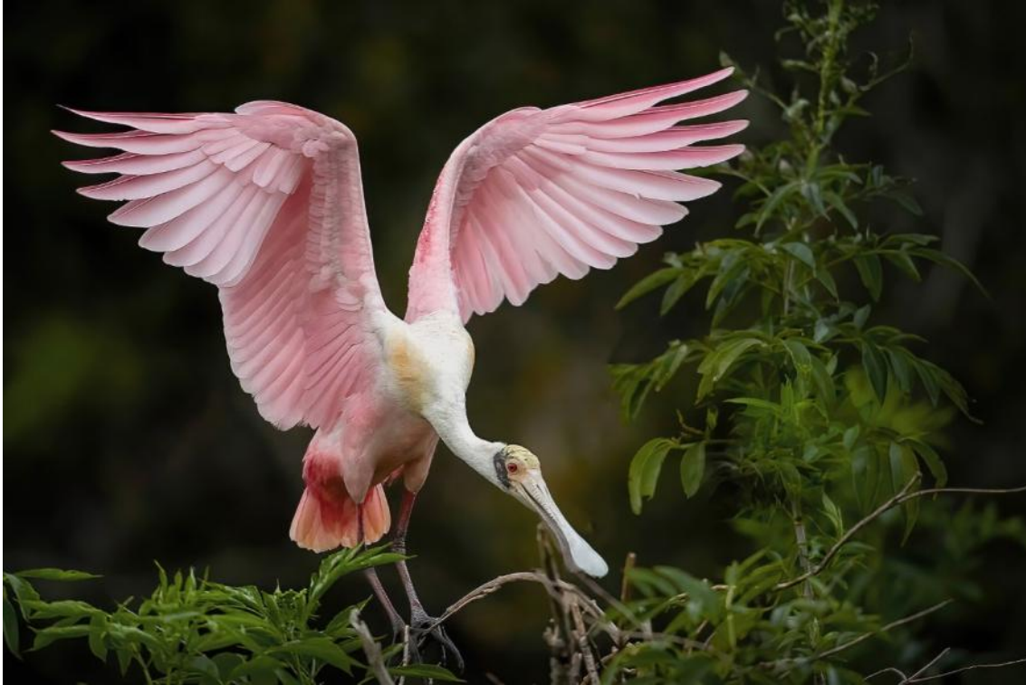
Digital Pictorial— Roseate Spoonbill