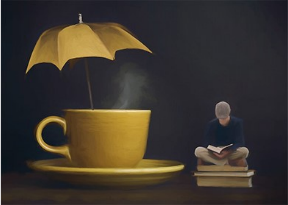
Digital Altered Reality