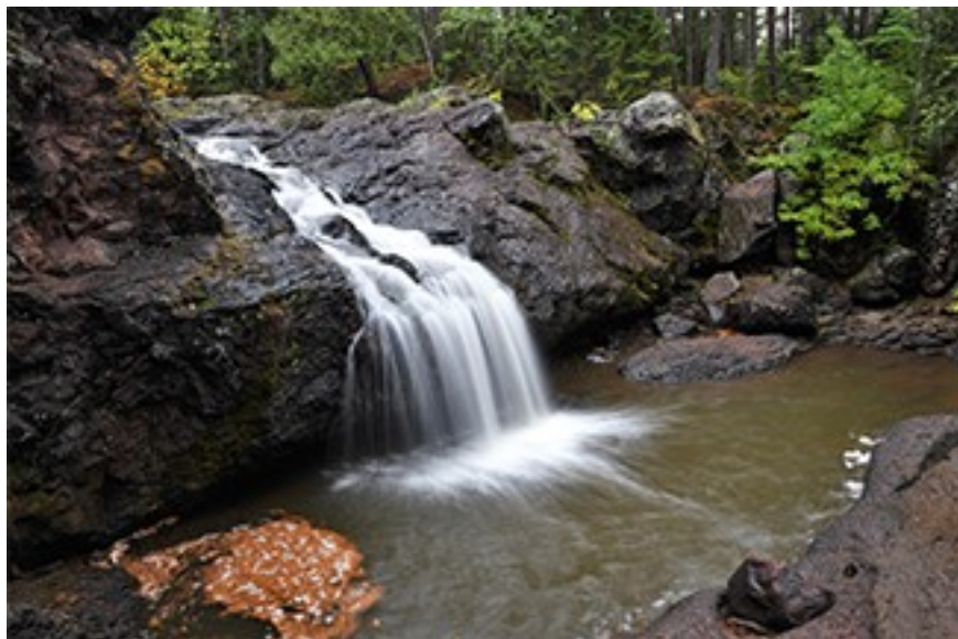
Duluth/Superior Area photos