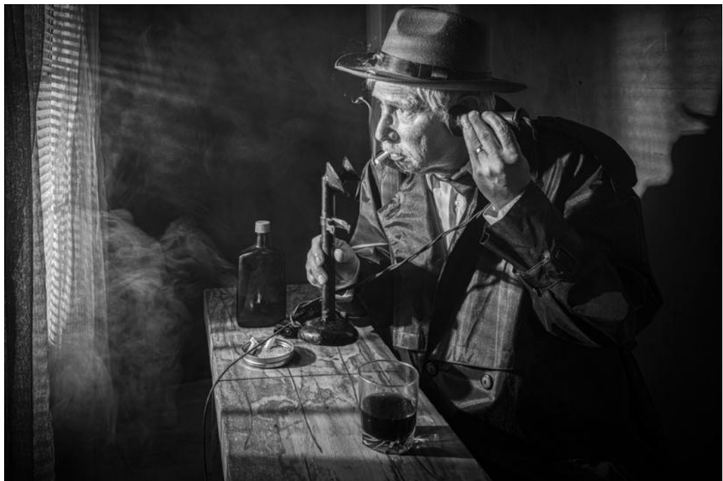
Digital Black & White