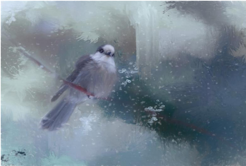
Digital Altered Reality